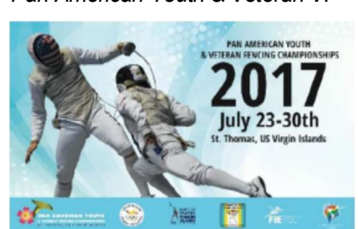
Pan American Youth & Veteran VI