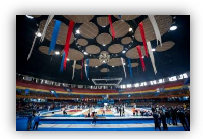
Habana, Cadets' Championships