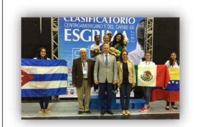
Puerto Rico Qualifiers CA Games