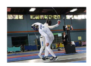
Epee Satellite Cup, San José